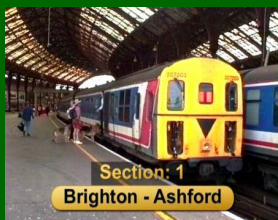
Section: 1 Brighton - Ashford

Section 1: Brighton – Ashford We start our journey at Brighton and stop at Lewes, Eastbourne and Bexhill before arriving Hastings. Changing trains at Hastings, we then visit all station stops to Ashford. Upon arrival at Ashford we see both before and after views of the new International station. Our set heads off for fuel.