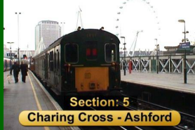
Section: 5 Charing Cross - Ashford

Section 4: Tonbridge – London Bridge Weekend engineering work resulted in no direct electric service between Tonbridge and London. A replacement thumper service ran non-stop between Tonbridge and London Bridge. Firstly we see the pair depart Tonbridge, then pass through Redhill and East Croydon, before arriving into London Bridge.