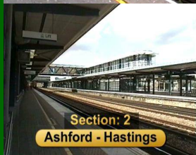
Section: 2 Ashford - Hastings

Section 1: Brighton – Ashford We start our journey at Brighton and stop at Lewes, Eastbourne and Bexhill before arriving Hastings. Changing trains at Hastings, we then visit all station stops to Ashford. Upon arrival at Ashford we see both before and after views of the new International station. Our set heads off for fuel.