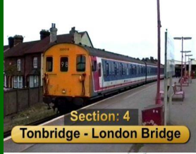
Section: 4 Tonbridge - London Bridge

Section 3: Reigate – Tonbridge After our stock departs the sidings we join the service to Tonbridge, visiting some stations en route.