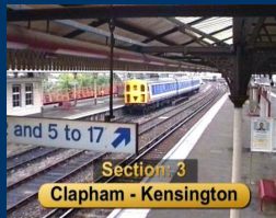
Section: 3 Clapham - Kensington

After watching the shuffle at Oxted we see the service pass through stations on the run to East Croydon. While at East Croydon we see the lunchtime unit swap. Then onwards we see thumpers pass through a number of suburban stations before finally terminating at London Bridge.