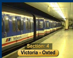
Section: 4 Victoria - Oxted

We take a ride on the shuttle from Clapham Junction platform 2 to Kensington Olympia. Then we return on the same set. At Clapham Junction we see 205029 for another working as well as an evening service which is en route to Victoria.