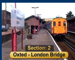
Section: 2 Oxted - London Bridge

We start our journey at the old Uckfield station on the far side of the level crossing in 1990. Taking the next service, we see the thumpers stopping at all stations to Oxted.