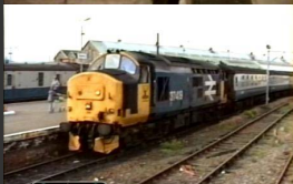
Section: 3 Inverness station movements

At Glasgow Queen Street 37419 waits with the Inverness service. We pass Eastfield in the rain but the day improves as we travel north. Pitlochry, Blair Atholl, Dalwhinnie, Kingussie and Aviemore are some of the locations where we see Classes 37 & 47 and an HST.