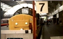
Section: 2 Glasgow Queen Street - Inverness

We join 37427 at Haymarket for our journey to Perth via the Forth Bridge. At Perth 37428 stands for next leg to Stirling. 37035 passes Falkirk crossing.