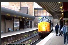
Section: 1 Haymarket - Perth - Stirling