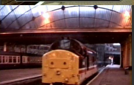
Section: 5 West Highland Line - Fort William

An early start from Inverness is made as we join 37404 on 05:52 to Aberdeen. We pass 37114, the Inverness bound train at Nairn. On arrival at Aberdeen a pair shunts the previous night's sleeper stock.