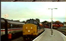
Section: 4 Inverness - Nairn - Aberdeen

Inverness Class 37 movements are witnessed over a couple of days. While based at Inverness we take a trip to Dingwall and Kyle-of-Lochalsh. The sleeper fails resulting in a loco change before a late departure.