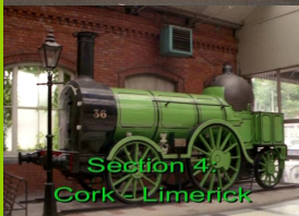
Section 4: Cork - Limerick