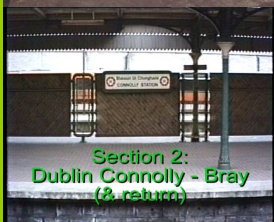
Section 2: Dublin Connolly - Bray (& return)