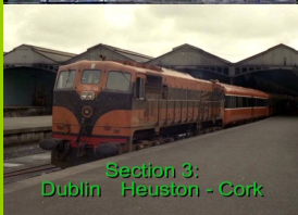
Section 3: Dublin Heuston - Cork