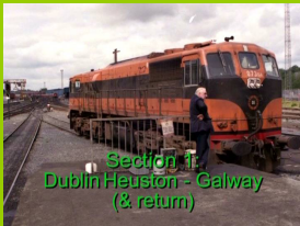
Section 1: Dublin Heuston - Galway (& return)