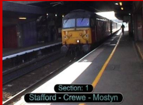
Section: 1 Stafford - Crewe - Mostyn

Section 1: Stafford – Crewe - Mostyn We join the Birmingham New St - Holyhead service at Stafford and then race the Euston-Holyhead service to Crewe. While at Crewe many Class 47 movements are witnessed before our departure. After Chester we see a service pass Mostyn box.