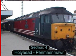
Section: 4 Holyhead - Penmaenmawr

Section 3: Llandudno Junction - Holyhead Returning to Llandudno Junction we then continue our journey passing Conwy and Penmaenmawr. At Llanfairpwll and Rhosneigr more down trains are seen before our arrival at Holyhead.