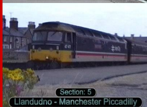
Section: 5 Llandudno - Manchester Piccadilly

Section 4: Holyhead - Penmaenmawr After a number of movements at Holyhead we start our return journey. Valley, Rhosneigr, Llanfairpwll and Gaerwen are visited before a couple of services at Bangor. At Penmaenmawr we see a Euston service pass after a steam special.