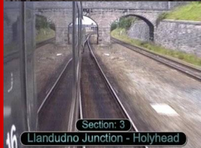
Section: 3 Llandudno Junction - Holyhead

Section 2: Mostyn – Conwy Valley At Mostyn 40122 fails on the White Rose Railtour. 47323 to the rescue and we are propelled to Prestatyn where the assisting loco is then run to the head of the train. At Llandudno Junction both locos depart the train and, later than advertised, head towards Blaenau Ffestiniog behind 47350.